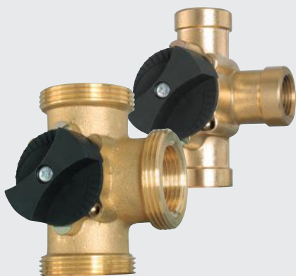
3-way mixing valve performance diagram

using profiled outlet holes. Two EPDM O-rings seal the shaft. The 4-way mixing valve can be mounted on any side. When mounting a valve with a distributor, you can adjust it by 45°. The boiler supply is factory set on the left. 3-way mixing valves are intended for straight-through flow paths. Return connection can be placed either on the right or the left side and is factory set on the left.